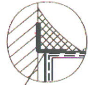
Bond Breaker Tape

The architecture, engineering and design of the project using Bullseye products are the responsibility of the project's design professional. All systems must comply with local building codes and standards. This detail is for general information and guidance only, and Bullseye Wall Technology, Inc, specifically disclaims any liability for the use of this detail and for the architecture, design, engineering or workmanship of any project. The project design professional determines, in its sole discretion, whether this detail or a functional equivalent alternative is best suited for the project. Use of a functionally equivalent detail does not violate Bullseye's warranty. This detail is subject to change without notice. Contact Bullseye to insure you have the most recent version.